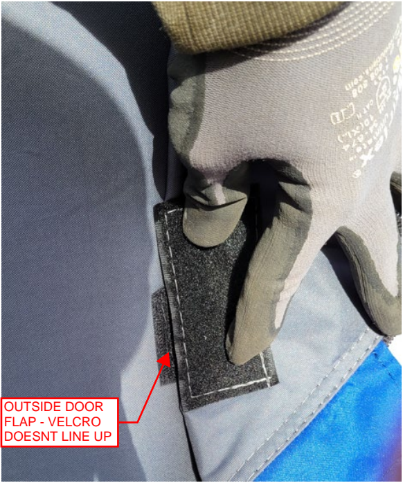
OUTSIDE DOOR FLAP - VELCRO DOESNT LINE UP