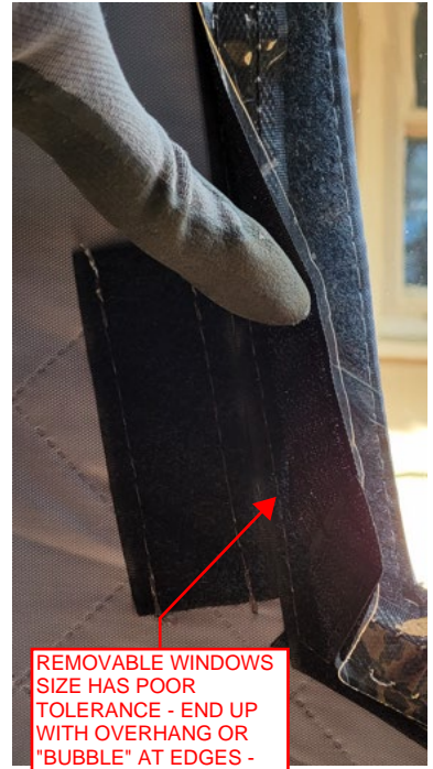
REMOVABLE WINDOWS SIZE HAS POOR TOLERANCE - END UP WITH OVERHANG OR "BUBBLE" AT EDGES - HARD TO LINE UP WITH VELCRO