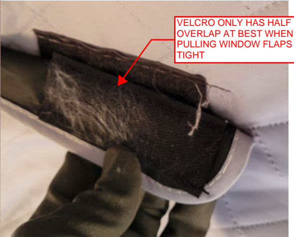
VELCRO ONLY HAS HALF OVERLAP AT BEST WHEN PULLING WINDOW FLAPS TIGHT