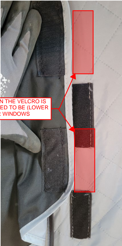
POSITION THE VELCRO IS SUPPOSED TO BE (LOWER CORNER WINDOWS)