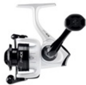
ABU GARCIA ABU GARCIA MAX ICE SPINNING REEL