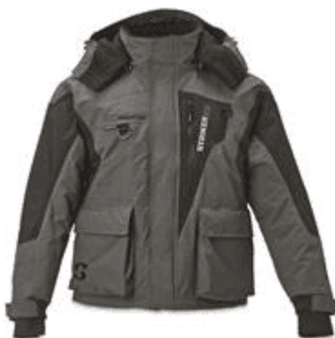
StrikerICE Men's Predator... >

Buyer's Club Pricing Applied at Checkout! NON-MEMBER $187.49