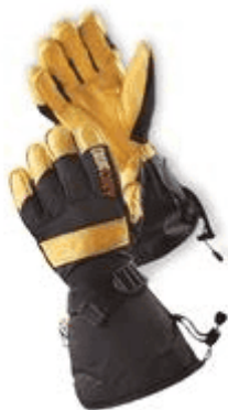
Guide Gear Men's Insulated... >