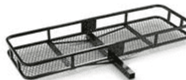
Guide Gear Cargo Carrier >

Buyer's Club Pricing Applied at Checkout! NON-MEMBER $187.49