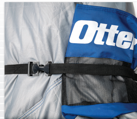
Exclusive Packing Strap with High Compression Quick Release Buckle