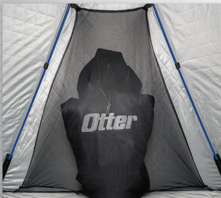
Two Overhead Cargo Storage Netting (Vortex Cabin Includes One)