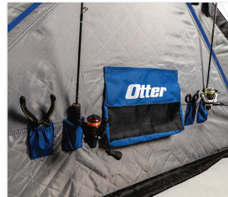
Integrated Rod/Tool Holders