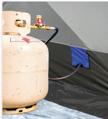
Propane Port with Hook and Loop Flap