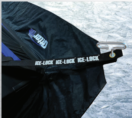
Exclusive Ice-Lock Anchor System

Includes: Canvas, Frame, Two Overhead Cargo Storage Nets, Anchor Tie-Down Kit, Locator Beacon and Carry Bag.