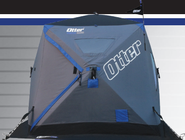
201534 - Cabin