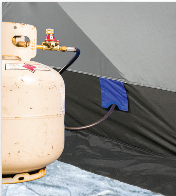
Propane Port with Hook and Loop Flap