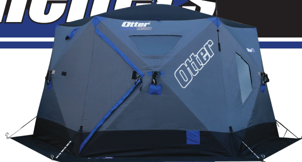
201536 - Resort