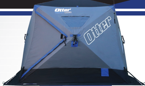
201535 - Lodge