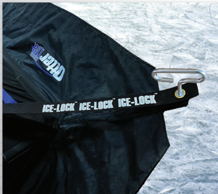
Exclusive Ice-Lock Anchor System

Includes: Canvas, Frame, Two Overhead Cargo Storage Nets (Vortex Cabin Includes One), Anchor Tie-Down Kit, Locator Beacon and Carry Bag.